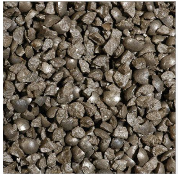
TABLE OF VARIOUS DIAMETERS OF CAST STEEL GRIT

We are one of the few names to offer a vast and qualitative range of industrial steel abrasive products. Committed to follow fair business practices, we have earned the desired goodwill in the MARKET. Owing to the dexterous team, state-of-the-art infrastructure, and the quality we offer, we have accomplished in attaining the maximum satisfaction and trust of our esteemed clients.